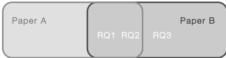
Figure 1. Paper and addressed research question

The overall aim of this thesis is to deepen our knowledge of the logics behind the business of industrial design such as how it is organized, the competencies of the industrial designer and the perceived role of industrial design in its client firms. The purpose of studying the business of industrial design was an observed growth in the industry at the same time as design, its methods, processes and the concept of design thinking received increased attention in the