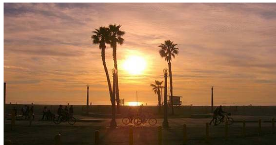
Sunset at Venice Beach

Finally, I am so glad that I have been able to experience this adventure and it will be a memory for life! I felt a little bit sad to leave California and I am deeply grateful to the contributors that made this Stanford stay possible: PIEp, the Sweden-America Foundation and Volvo Car Corporation. Thank you very much!