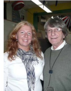
Presentation, some food, some drinks, and a lot of discussions at SUDS